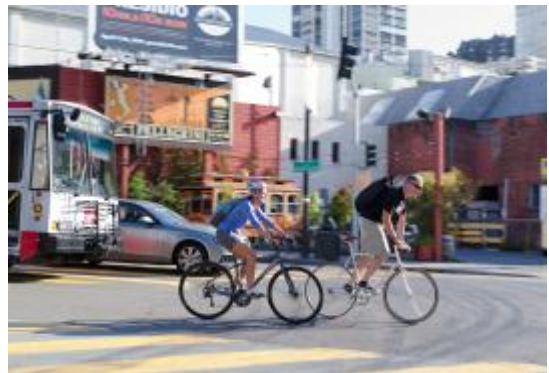
Having safe, secure and conveniently located bike parking can promote more bicycling for commuting and recreation.

Requirements for additional parking for new non-residential development in Downtowns and town centers should be eliminated, wherever feasible, based on local conditions and community plans. The elimination or reduction in city parking minimums will allow developments to proceed with lower levels of parking in the specific situations where developers think these are viable, and will not prevent the construction of new parking where warranted by the market.