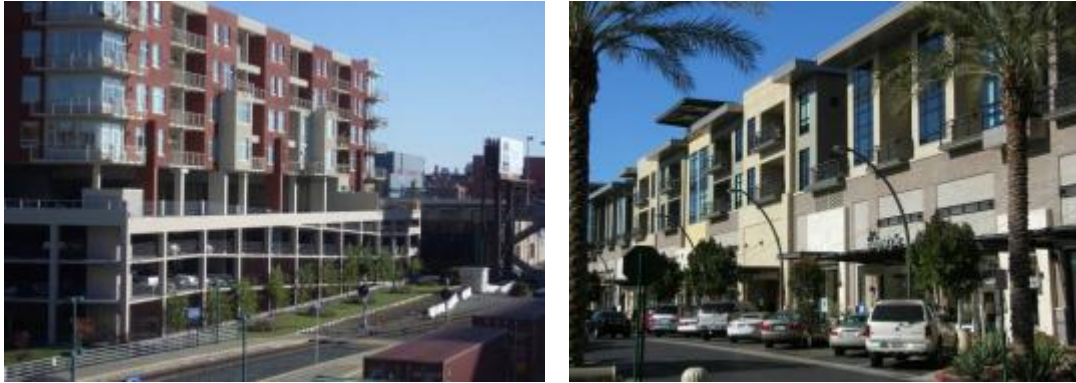
Bay Area cities can optimize the use of parking facilities by allowing multiple uses to share the same facilities when the uses experience peak demand at different times of day or day of week.