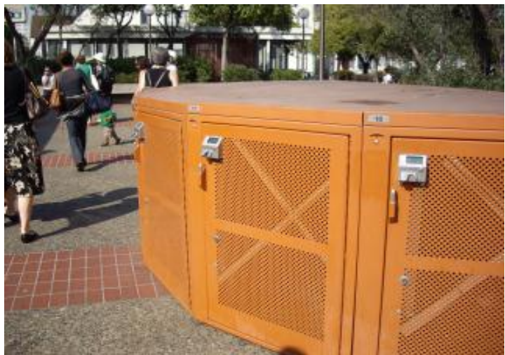
Standards for bicycle parking should include provisions for lockers at work places.