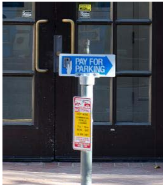
Pricing can help manage parking availability.

As described in the Ten Point Plan overview, pricing is a powerful tool to regulate parking availability and the San Francisco Planning Code is an excellent model of how this can be done. Another example is to have a parking tax. For example, San Francisco's Parking Tax (Article 9 of San Francisco Business and Tax Regulations Code Sections 601 and following) applies to the rental of all non-residential parking spaces in the City. This is true even when a parking space is furnished with rented office space and rent for the parking space is not separately stated in the rental agreement. In such a circumstance the Parking Tax is due on the amount that would have been charged for the parking space if rent for the parking space had been separately stated based on the market rate for rent of parking spaces in the part of the City where the parking space is located. The Parking Tax applies because a building owner or owner's agent who receives rent from a building tenant for the occupancy of a parking space is an operator who must collect and remit the tax from the parking space occupant to the City. Revenues from the Parking Tax are split between the General Fund (20 percent) and the Municipal Transportation Fund (80 percent), the latter financing the City's transit system - Muni.