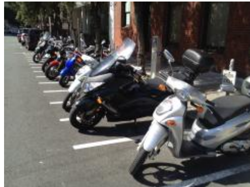
Motorcycle parking spaces need dimensional standards.