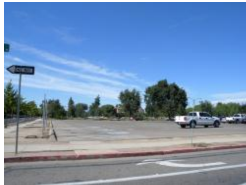
Unused parking area creates blight. This land can be put to better use.

The best practices for access and parking regulations reflect and support transit-oriented and pedestrian friendly areas; they will help make infill development viable in Priority Development Areas and other places identified by local jurisdictions and create more walkable, livable communities. They are based on the principle that parking should be managed as a resource that has critical impacts on visitor and commuter access, retail health, traffic safety, economic development, and streetscape quality, and that parking should be managed to achieve both transportation objectives and other community goals. These goals should include consideration of the special needs of handicapped persons. These ideas also respond to trends showing growing interest in living in transit-served areas, with less dependence on the automobile.